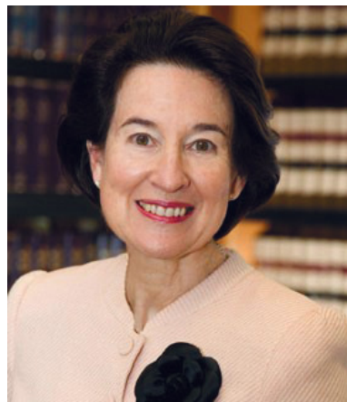
THE HONOURABLE MARGARET WHITE AO FORMER JUDGE OF THE QUEENSLAND COURT OF APPEAL