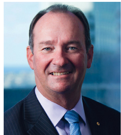
THE HONOURABLE MARK VAILE AO CHAIRMAN WHITEHAVEN COAL